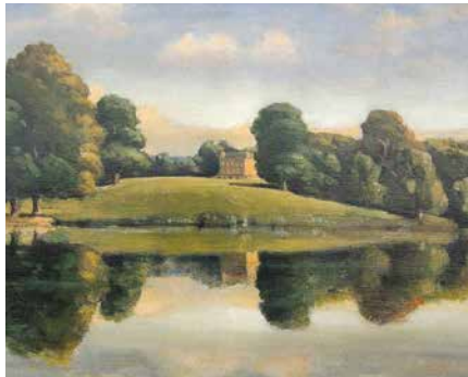
Faringdon House - an illustration

Thursday 13th June, 2.00 for 2.30pm start