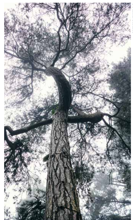
A black pine at the Arboretum