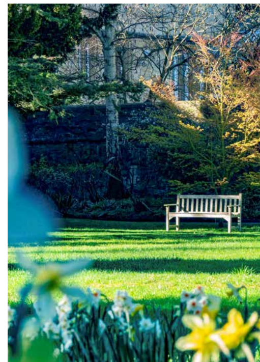
Wadham College Garden

'In the "merry month of May" a visit to the many varied gardens hidden behind the walls of Wadham College. Originally a series of orchards and market-gardens carved out from the property of the Augustinian priory, Wadham's gardens have been significantly modified and added to over the past 400 years. During a tour of the gardens, the Garden Adviser, Andrew Little, will share his extensive knowledge - some trees were grown from seeds which he planted three decades ago. Numbered amongst the tree collection are a holm oak, silver pendant lime, tulip tree, ginkgo, dawn redwood, Tree of Heaven, Incense Cedar, Corsican pine, Wollemi pine and a rare Chinese