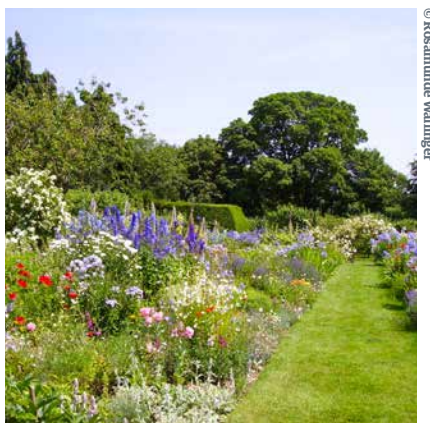
Upton Grey Garden