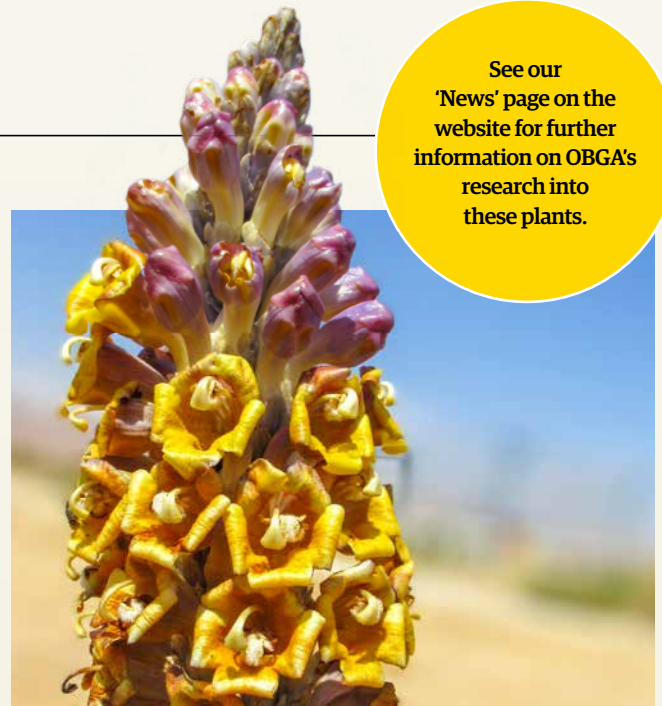
Cistanche tubulosa , wild in the Middle Eastern desert

Cistanche is a genus of parasitic plants (sometimes known as 'desert hyacinths') which have been used in traditional herbal medicine since antiquity, and are still traded widely today. Our recent work, published in Phytotaxa , examines the confusion surrounding the taxonomy of the most widespread species, Cistanche tubulosa . Our work shows that this species name has been applied incorrectly to plants that comprise a polyphyletic group, meaning they are not all derived from a common ancestor. Moreover the so-called type specimen for C. tubulosa is missing. A type is a plant specimen to which the scientific name of that plant is formally associated; it serves to anchor the defining features of a particular taxonomic group. When a type specimen is lost or destroyed, botanists designate a new specimen, or neotype, to serve in its place to maintain nomenclatural stability. To resolve the taxonomic confusion surrounding C. tubulosa , we assigned a neotype for the species, using a herbarium specimen housed at Kew, collected from South Sinai in 1945. We hope that this act (known as a neotypification) will help stabilise the taxonomy of C. tubulosa , resolve confusion, and in turn, direct conservation efforts.