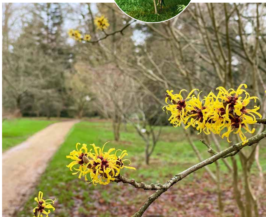
Witch hazel at the Arboretum