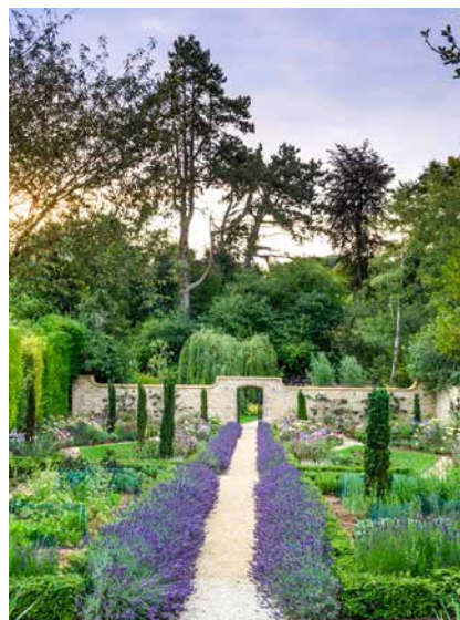
Colebrook House Garden