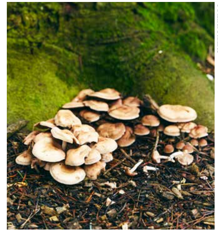
Fungi at the Arboretum