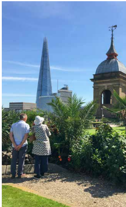
View from Cannon Bridge House