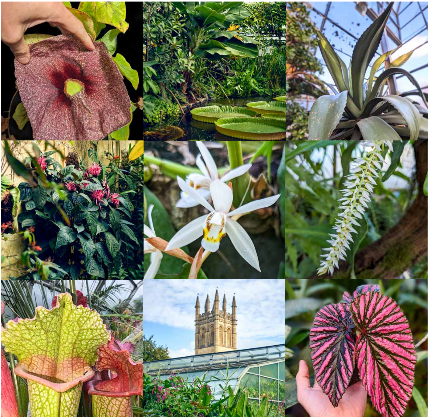
Aristolochia in bloom in the Nursery Houses; Victoria cruziana ; Agave salmiana var. ferox ; Justicia carnea ; Coelogyne ovalis ; Dendrochilum glumaceum ; Sarracenia hybrids in the Carnivorous Plant House in December; Magdalen tower behind the carnivorous house; The leaves of Begonia breviflora in the Nursery Houses - they rival the colour of any flower.

Regular visitors to the Arid House cannot have failed to notice the specimen of Agave salmiana var. ferox . For years we have been patiently waiting for it to show signs of blooming; should it do so, we will need to remove panes of glass to make way for the tree-like proportions of its blossom.