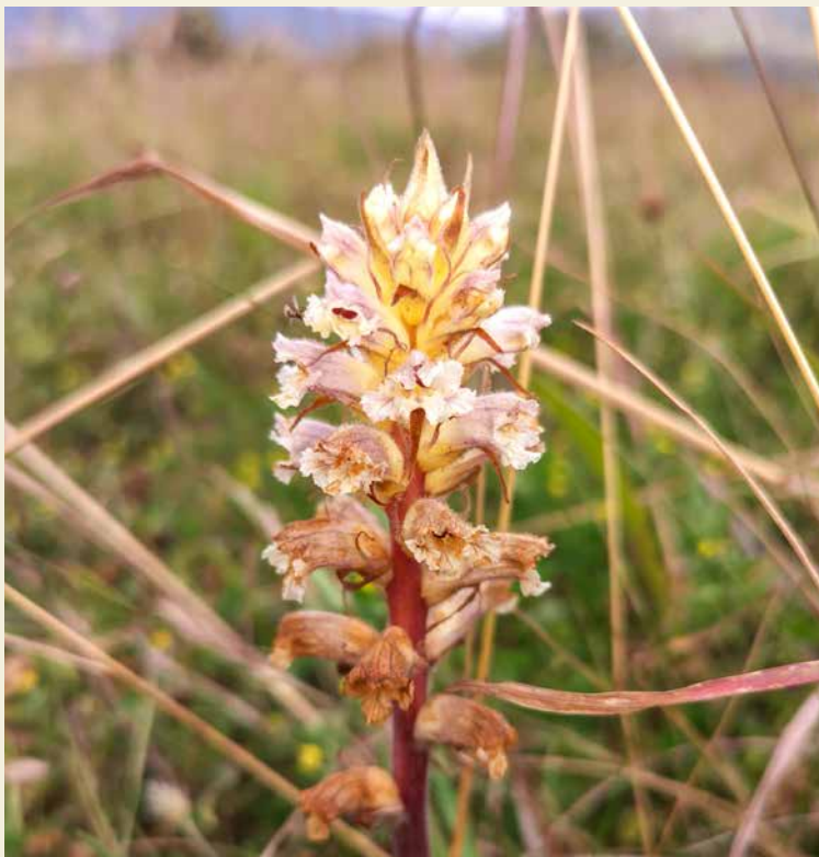
Orobanche picridis growing in a brownfield site in South Wales. Right: Chris Thorogood's illustration of Orobanche picridis and related plants

20-year survey revealed a fifteenfold fluctuation in annual abundance. This observation, together with our recent discovery of a thriving meta-population of O. picridis in brownfield sites in South Wales, suggests that whilst populations may be declining in some locations, they are increasing in others.