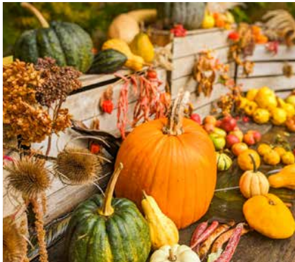
An autumnal display at the Botanic Garden in November

OBGA's collections also support a range of biodiversity besides plants, including fungi and insects: 84 invertebrate species were recorded at the Arboretum in 2023 including Zygina nivea , a rarely-recorded leafhopper that arrived in the UK from the continent in 2010 (our thanks to volunteer John Bloomfield for this record) - see page 7 for more information.