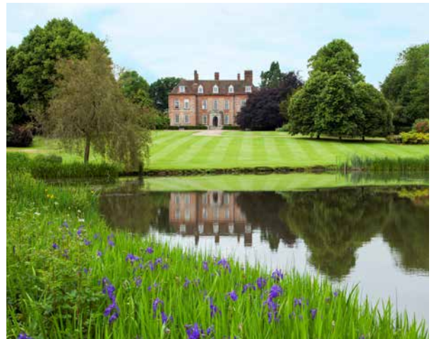
West Woodhay Garden