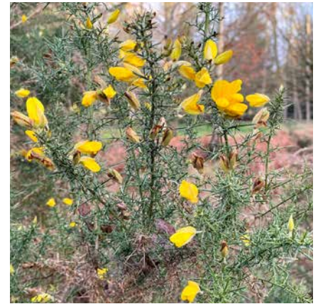
Gorse in flower at the Arboretum