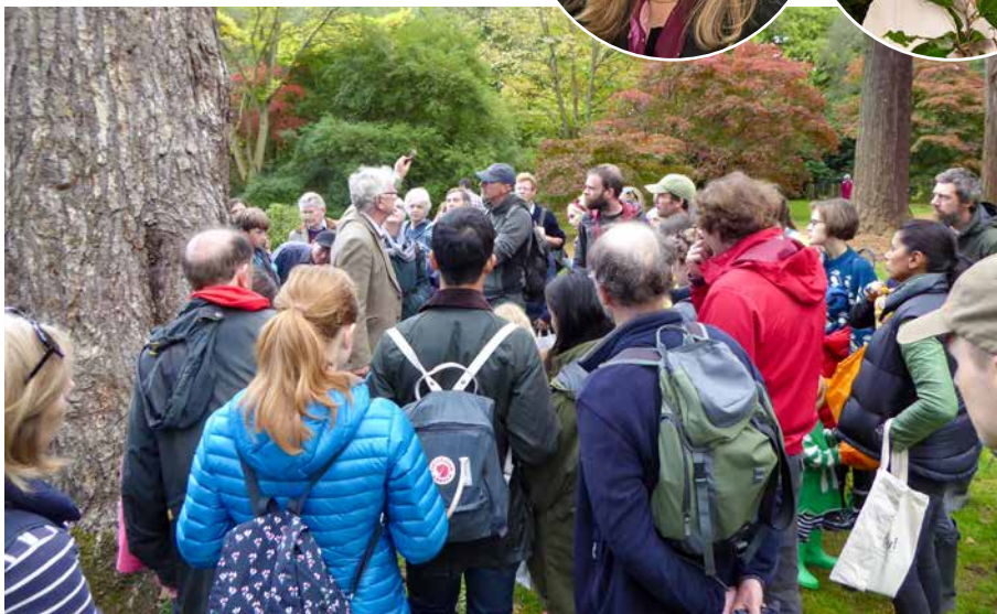
The Fungus Foray in full swing

The Museum of Climate Hope trail concluded in December. This trail took participants across all six of the Gardens, Libraries and Museums (GLAM) institutions and was launched in July 2023. Each venue featured two or three items with associated interpretation explaining how they represent transformation, resilience or inspiration, in the broader context of climate change. The trail explored positive stories that have helped tackle climate anxiety among teenagers. Over the six months, 1,702 visitors took part in the trail at Oxford Botanic Garden, and accessed information about our living specimens using QR codes displayed alongside them.