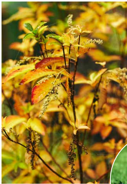
Left and below