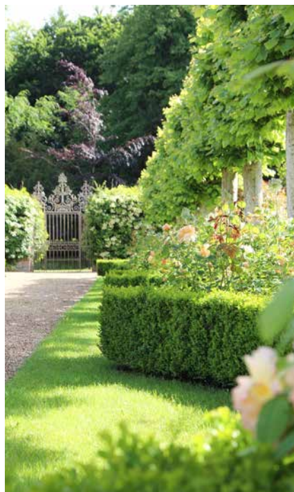
Pusey House Garden