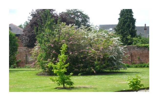
Hawthorn at Thwaite

The gardens were formerly part of Thwaite Hall which has been noted as a Grade 2 Garden of Special Historic Interest, with a lake and woodland in a further 28 acres. The Thwaite tree collection is an important collection of mature rare trees containing four National Champion Trees and 31 Yorkshire Champion Trees. More information can be found at: <a href="http://thwaite-gardens.hull.ac.uk/">http://thwaite-gardens.hull.ac.uk/</a>