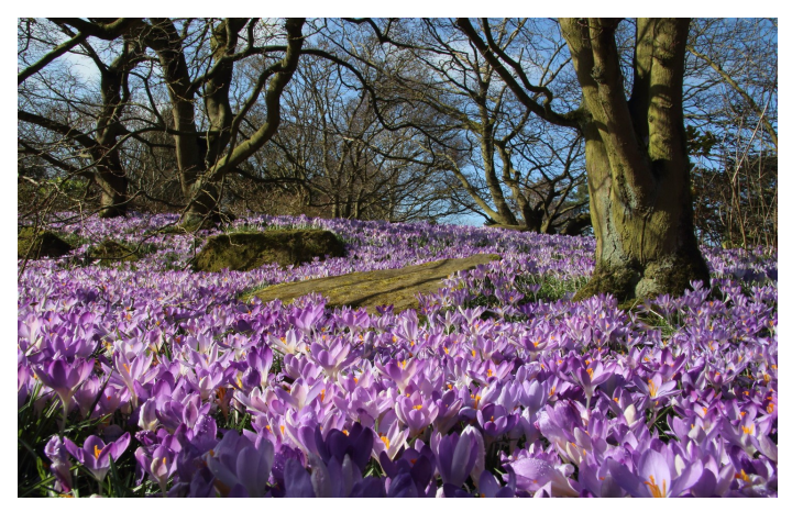
Crocus Sunday 2019